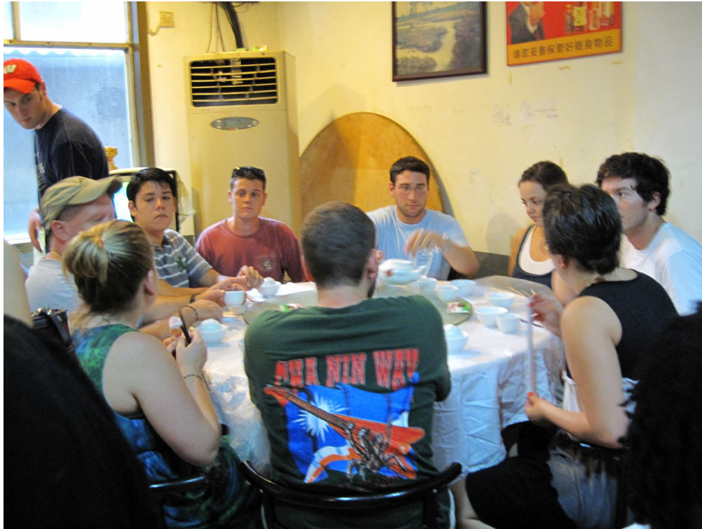
WorldTeach China volunteers enjoying a small lunch at Changsha, Hunan Province, China

2) Restaurants and schools in Hengyang, China often do not have toilet paper or soap in their bathrooms. I often have to carry my own toilet paper almost everywhere. In addition, most restaurants don't even have napkins to clean your mouth or hands.