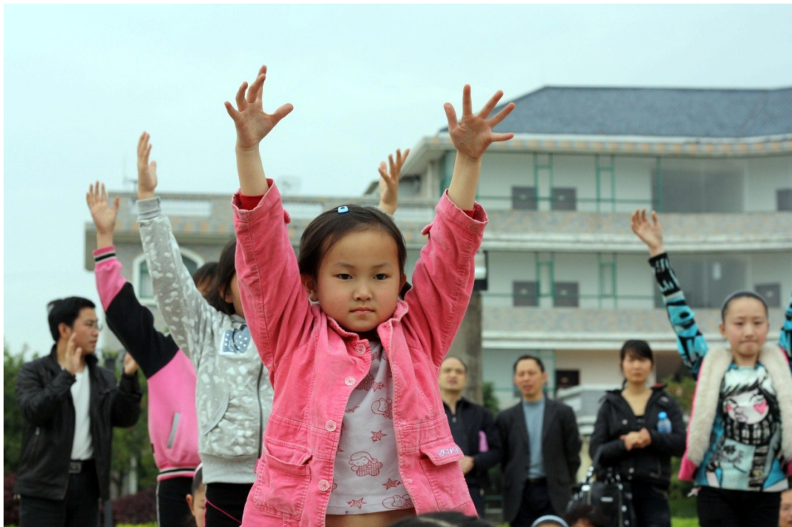
A little Chinese girl dance to a song in a park at Hengyang, China.