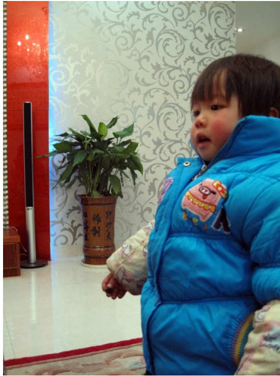
A Chinese toddler from Hengyang, China tries to stay warm during the winter holidays

10) Many babies and toddlers in China have slits in the back of their pants. Why? To go to the bathroom, of course! It's not uncommon to see a toddler squatting on the sidewalk and relieving himself/herself. I understand the economics of it (diapers are an unnecessary expense), but I often wonder how the mothers of children under 2 are able to ensure they don't get peed and pooped on.