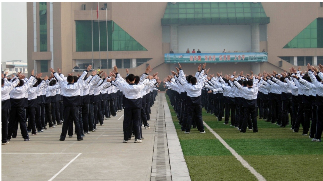
Chinese students warming up prior to their physical activity in “ChengZhang Middle School” at Hengyang, China.