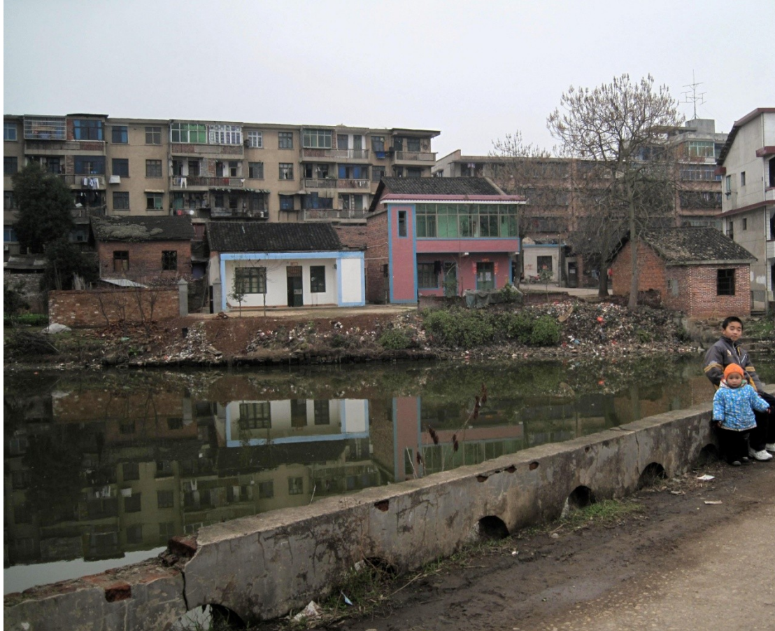
Two rural Chinese boys await for a bus at Hengyang, China

4) In the latest 2010 statistics report, it states that more than 60 percent of Hengyang’s population lives in slum conditions. I can easily find poverty within a 5 minute walking distance from my school in Hengyang, China