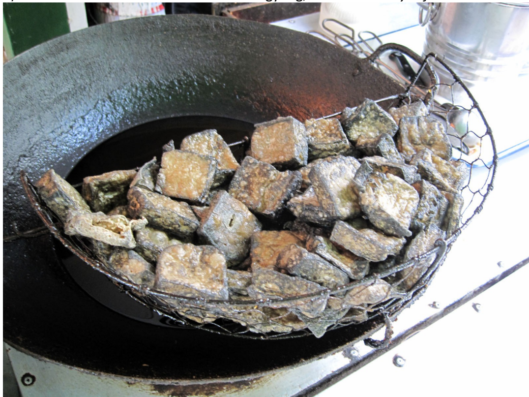
Fresh sticky tofu cooked and ready to be served at Hengyang, China

14) One of the most famous snacks at Hengyang, China is “stinky tofu.”