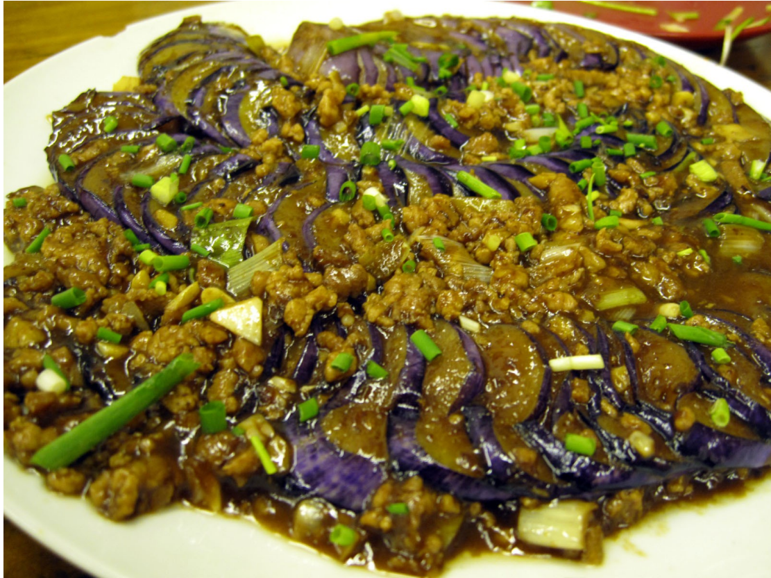
A Chinese eggplant dish served with beef at Hengyang, China.

13) One of the most famous vegetable dishes at Hengyang, China is “Eggplant.”