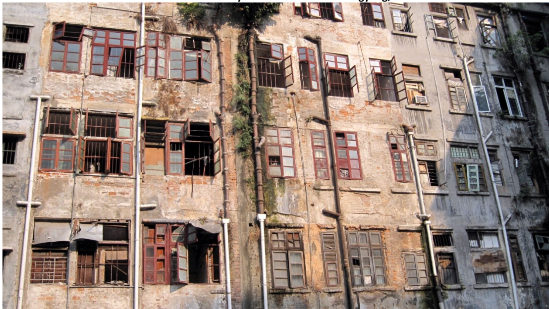
Many Chinese residents live in poor condition at Hengyang, China