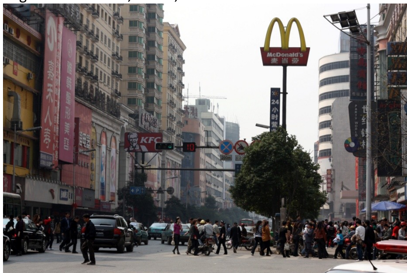
The main intersection of Hengyang, Hunan Province, China.

1) The traffic is crazy here in my city at Hengyang, Hunan Province, China!!! Cars don't wait for anything. There is no such thing as “people have the right away” when crossing the streets. Even when the traffic lights are working, I cross the street at my own risk....you know how in America when the traffic lights are out everyone treats it like a stop sign. Well, here in my new city, they apparently do the opposite and just pretend that there's no traffic-controlling device at all. It is always a constant joy to watch weaving cars and honks, honks, and more honks.