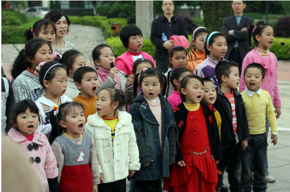
Chinese children’s singing a song in a park at Hengyang, China.

9) I find that kids at Hengyang, China are the cutest group of children’s ever.