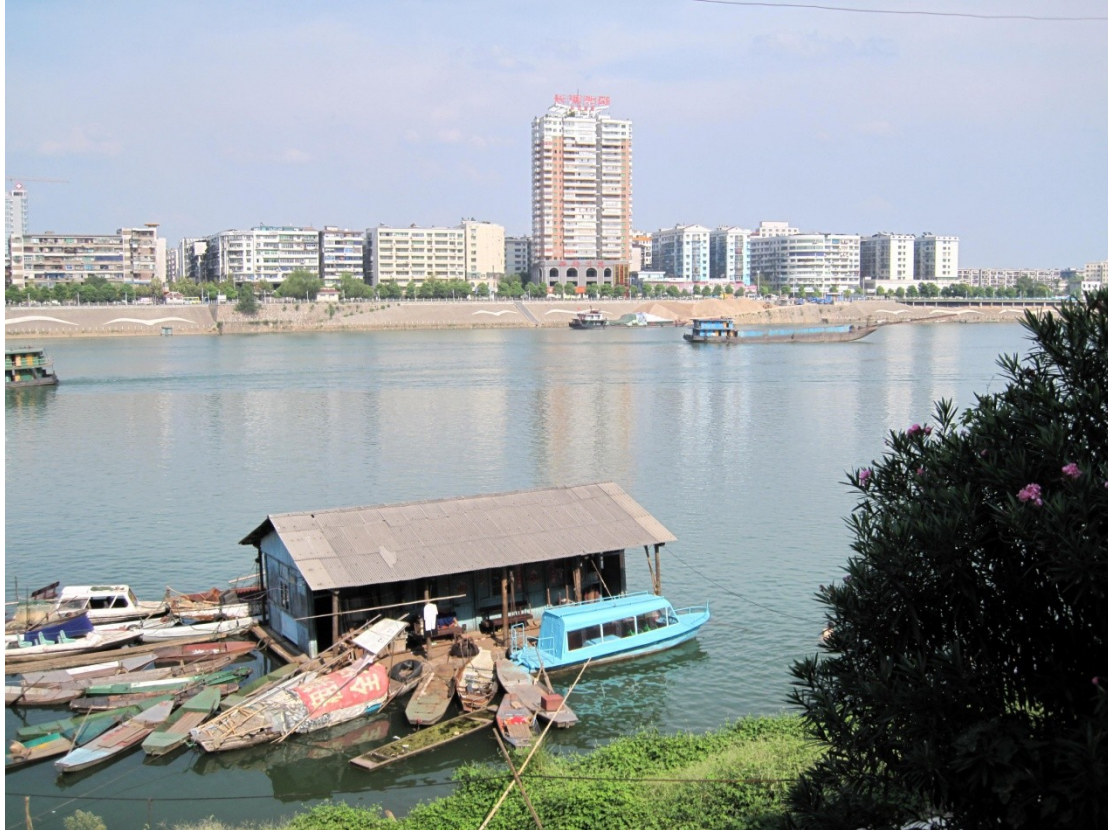
A boat sitting in the Xiang River at Hengyang, China

19) In a small town like Hengyang, everyone wants to take me out to their hometown and to show me how wonderful there city is. Also, many of my students really want me to meet their mother (which I find quite odd).