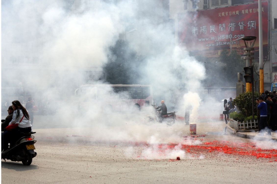
Fireworks burn in the middle of a main intersection at Hengyang, China.

5) Hengyang people often enjoy the sights and sounds of burning garbage and fireworks almost every day. In fact, it is common to see Chinese people playing with fireworks in the middle of a Chinese street just to hear the sound of it.