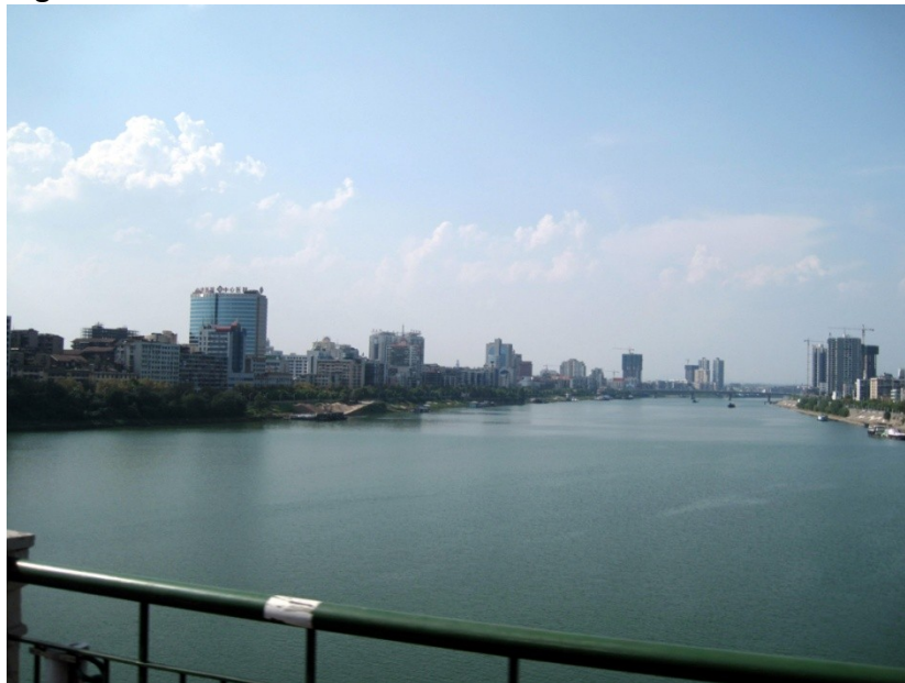
The beautiful Xiang River at Hengyang, China.

11) One of the best aspects of living at Hengyang is being right next to the Xiang River, the largest river in the Hunan Province of China.