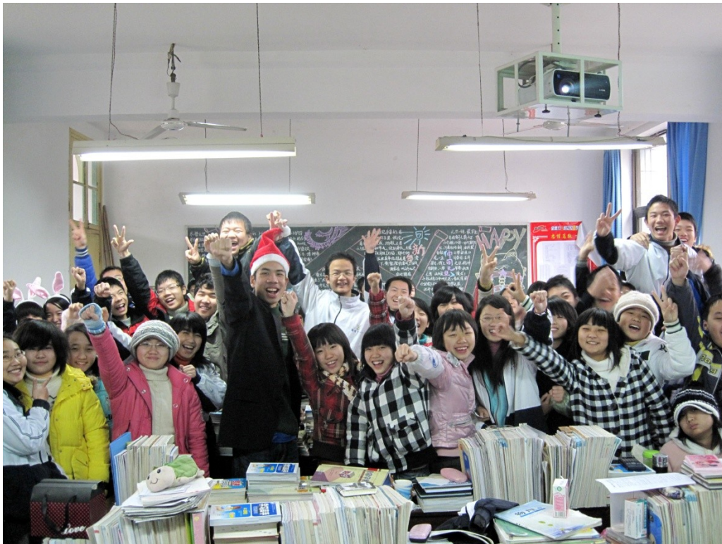
My high school students and I celebrating Christmas day on December 25, 2009 at Hengyang, Hunan Province, China.