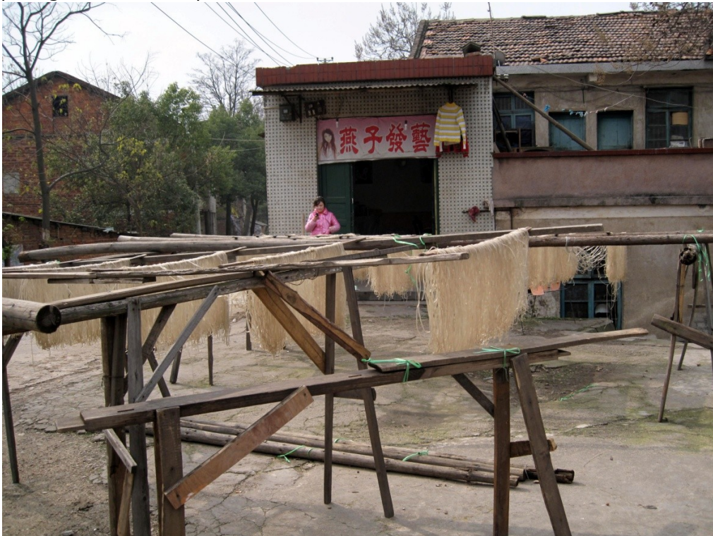
A Chinese woman organizing and preparing rice noodles at Hengyang, China

8) According to Chinese locals, the most popular food to eat at Hengyang, China is rice noodles. Below is a picture of local rural Chinese women from Hengyang, China preparing to sale and ship off rice noodle.