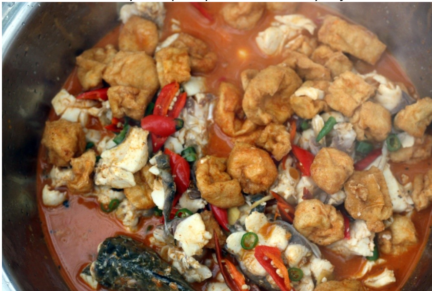
Tasty spicy tofu and fish at Hengyang. Hengyang is the home of fish and rice in the Hunan Province of China.

3) In my city, everything that I eat is spicy. If I tell the cook to add no spice, many of them would look at me oddly and quickly ask “ Where are you from? ”