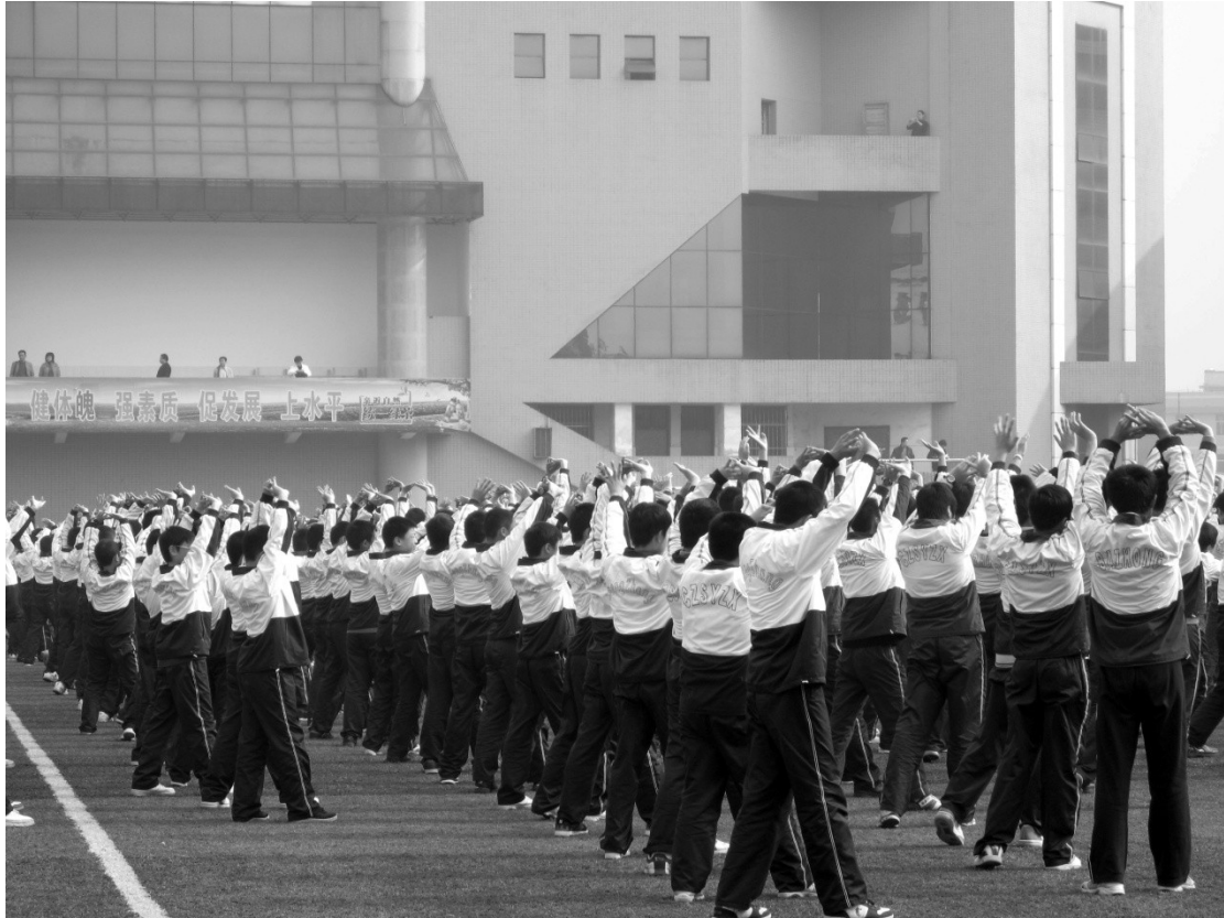
Students exercising in “ChengZhang Middle School” at Hengyang, China.

12) In all Chinese schools, students are required to partake in Physical Education for less than 15 minutes per day.