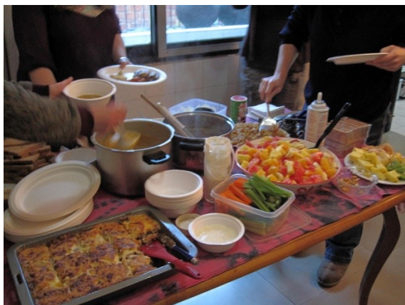
My first American food lunch in Hengyang, China