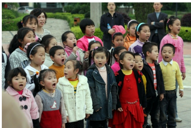
Chinese kiddos singing and dancing in Hengyang, China...soo cute!!