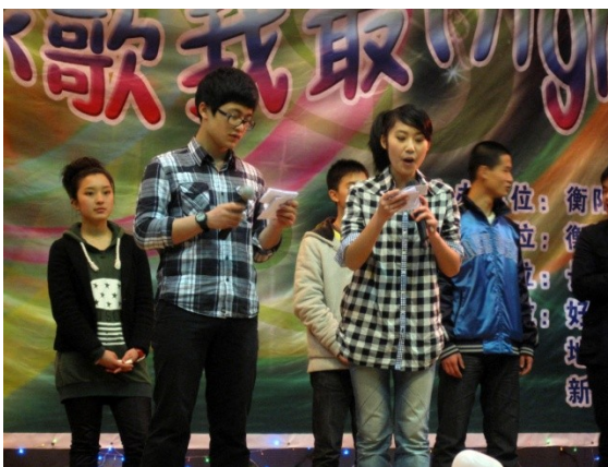
My high school students performing during a singing competition