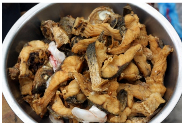
Famous fish and tofu dish in Hengyang, China