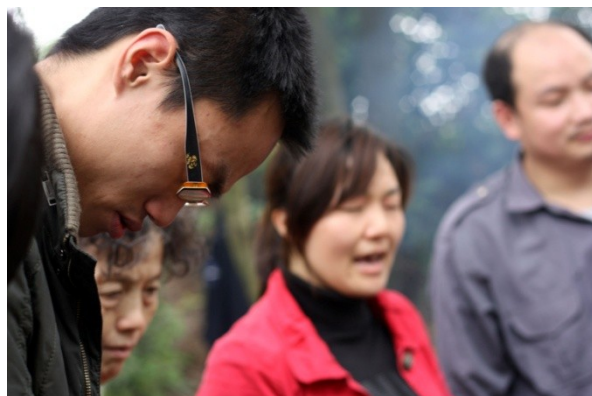
Friends praying after Sunday underground church service in Hengyang, China