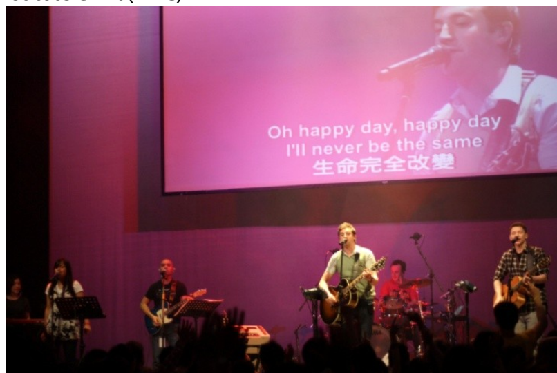
Tim Hughes leading worship during "Worship Central" conference in Hong Kong