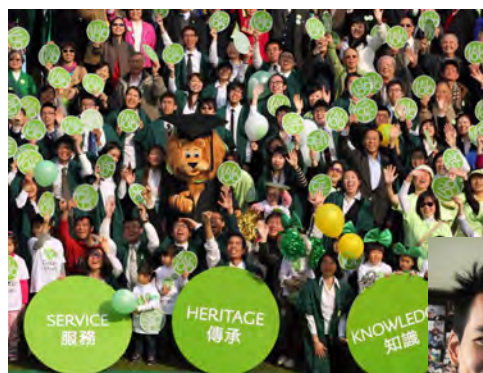
Celebrating HKU 100th birthday of Service, Heritage, and Knowledge on January 16, 2011

“I will honor Christmas in my heart, and try to keep it all the year.” ~ Charles Dickens