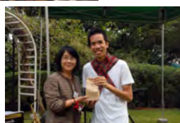
With the HKU Tinkling Dance Team to support the HKU Museum Society