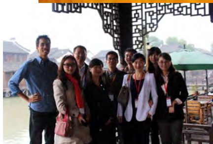
Standing next to new undergraduate students at HKU

"Christmas isn't a season. It's a feeling". ~ Edna Ferber