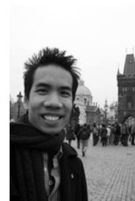
Standing on a bridge in Prague, Austria