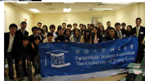
The launch of the HKU PGSA Buddy Club