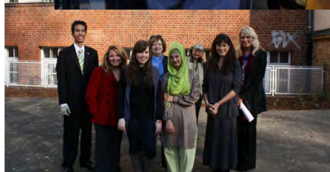
Standing next to a guard in Berlin,