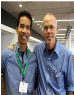
Standing next to scholar Bill McKibben at "2011 AASHE Conference on Sustainability in Higher Education" in Pittsburgh