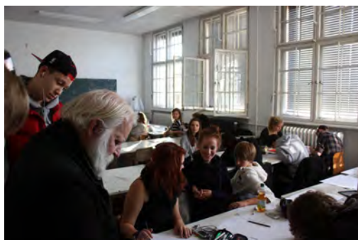
Meeting the students in a classroom at Berlin, Germany.