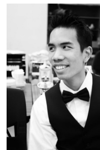
At a dress rehearsal with the “HKU English Drama Society” for the production Through Looking Glasses .

personal) affect students’ learning and living experience, and b) student involvement (academic and social) affect students’ learning and living experience. At the end, several graphs and charts displayed Chinese students’ professional and social growth while studying at a world-class institution in China. The dissertation received high praise and distinction, that later led to a published book entitled “Students’ Experience at World-class Universities in China” .