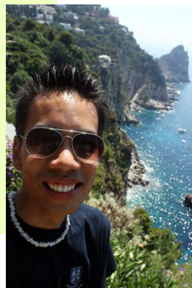
Standing behind a beautiful ocean in Capri, Italy on July 15, 2011

Aside from Italy, my one week experience studying and traveling to the Netherlands was hosted by the Utrecht Summer School program at Nyenrode Business University. While at Utrecht, I had enrolled and participated in a business graduate course on CSR and Sustainability. Some of the topics covered helped me to understand what large corporate organizations seek from future employees, specifically the idea to incorporate CSR into the workplace environment. Overall, the course expanded upon my business ethics skills of which I hope to apply in the field of higher education.