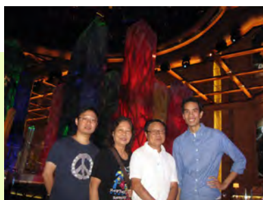
MERRY CHRISTMAS AND HAPPY NEW YEAR!!! :)